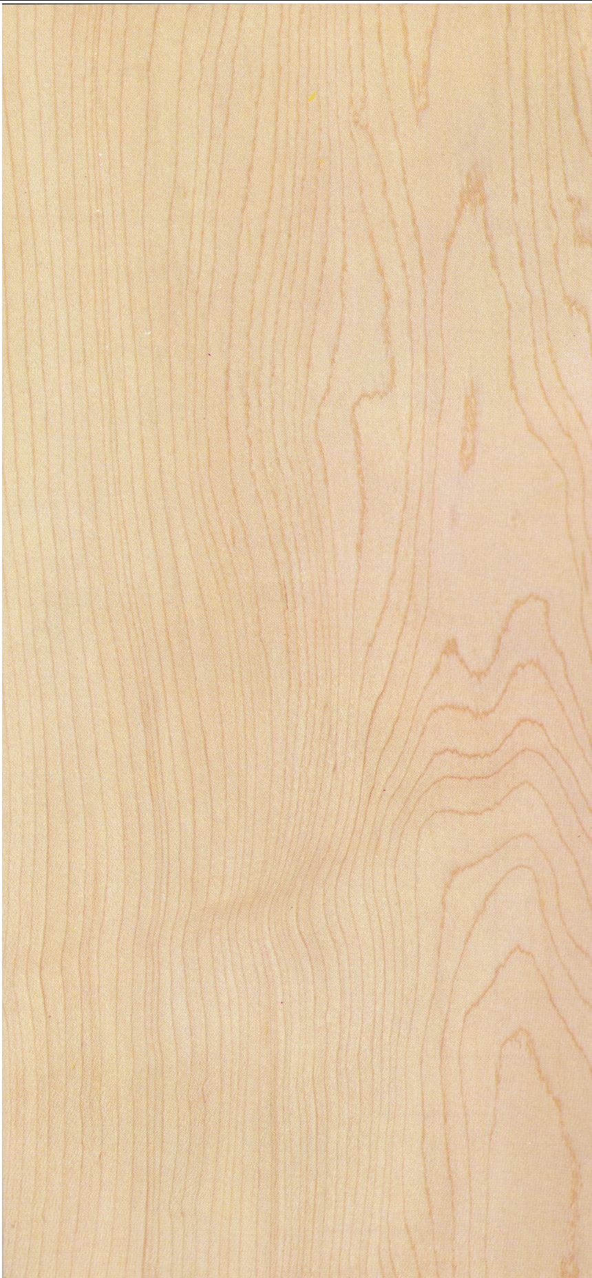
Maple, Hard "Select White" (Sapwood) (Acer saccharum)