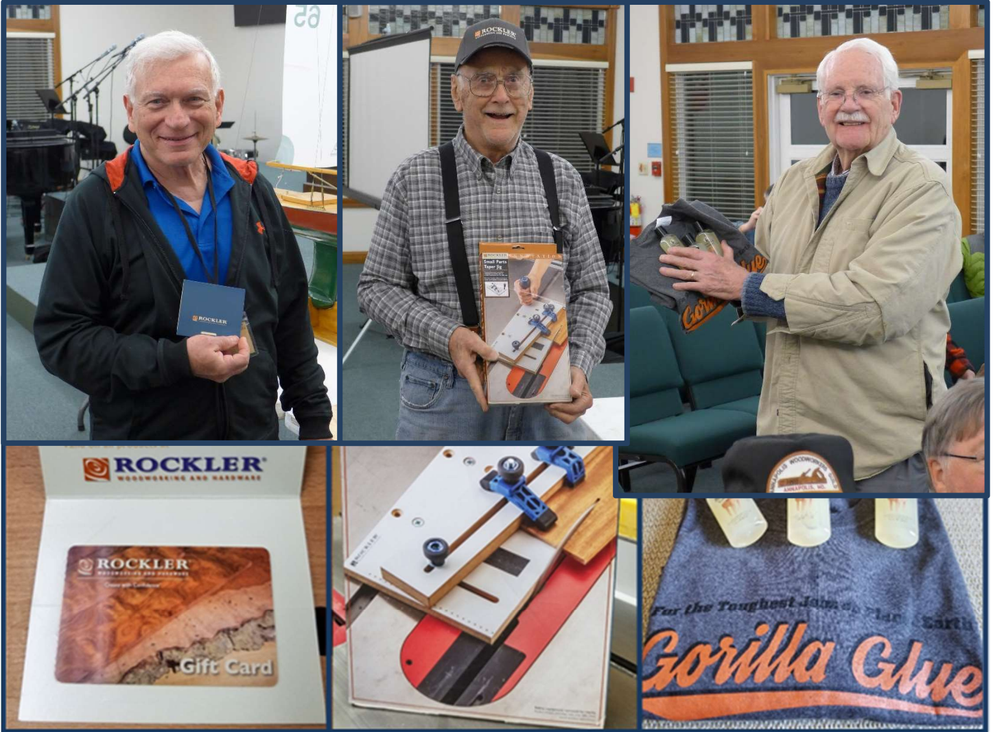
$50 Rockler Gift Card