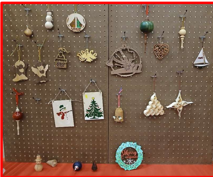
The ornament exchange