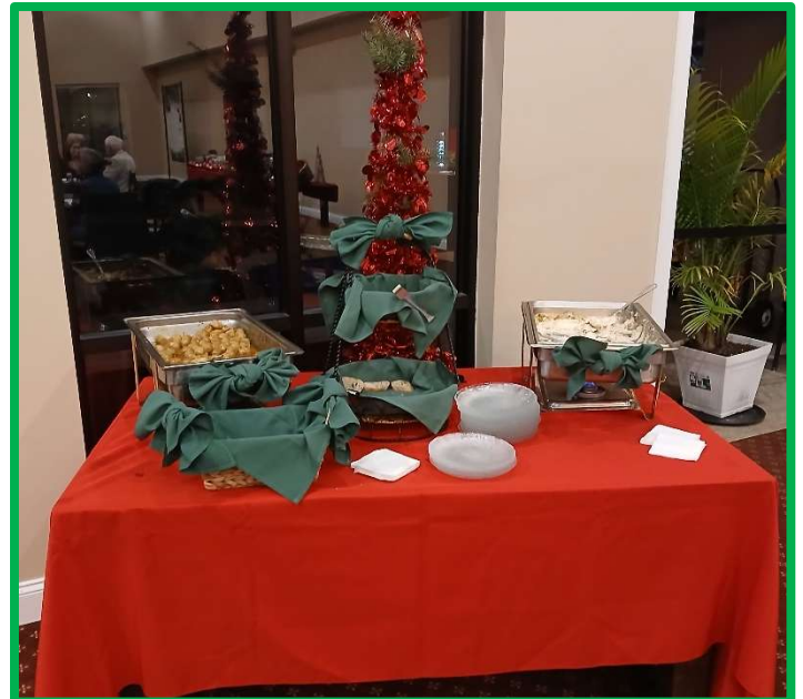
Appetizers - crab dip and meatballs