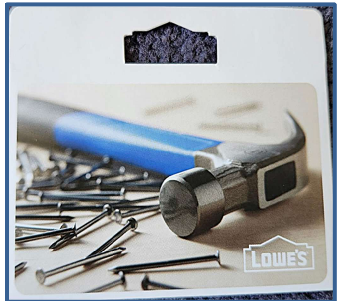
$50 Lowe's Gift