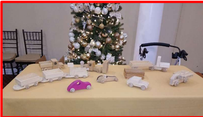
Samples from the Toy Workshop

The December meeting was the setting for the Guild's annual Christmas dinner. Hosted by Saints Constantine and Helen Church on Riva Road, the event was attended by sixty-four members and their guests. A merry time was had by all.