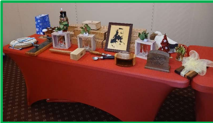
The gift table

The December meeting was the setting for the Guild's annual Christmas dinner. Hosted by Saints Constantine and Helen Church on Riva Road, the event was attended by sixty-four members and their guests. A merry time was had by all.