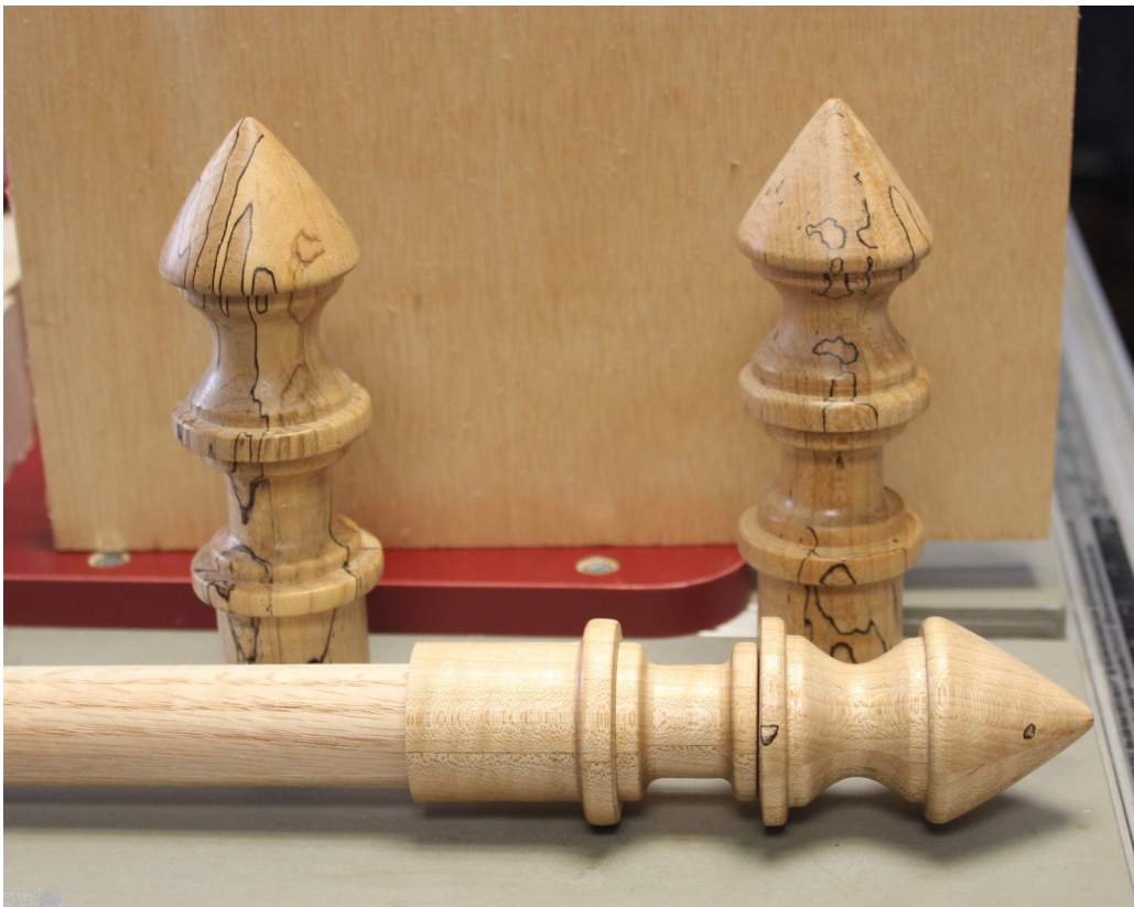
Three of eight banner pole finials